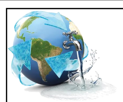
NJ has 20 watershed management areas.