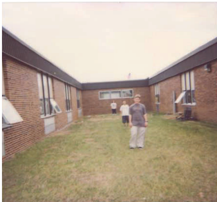
Participants Key to Integration and Sharing the Load! It takes a Village.....

The Southern Regional Middle School staff works in cross-discipline teams so that the math, science, social studies, language arts, and physical education instructors can teach a cross-curricular unit. This team chose Pinelands as their theme and topic. This lent itself very well to the creation of a Pinelands native plant habitat.