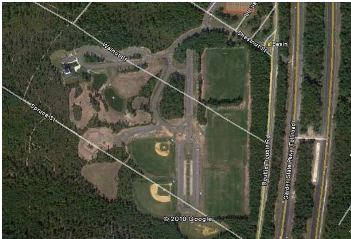
JAKES BRANCH COUNTY PARK – Double Trouble Road, Beachwood Approximate 40 acres total developed portion of the site